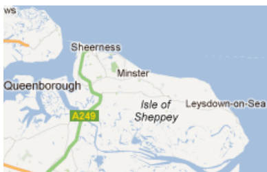
AERIAL VIEW OF THE ISLE OF SHEPPEY