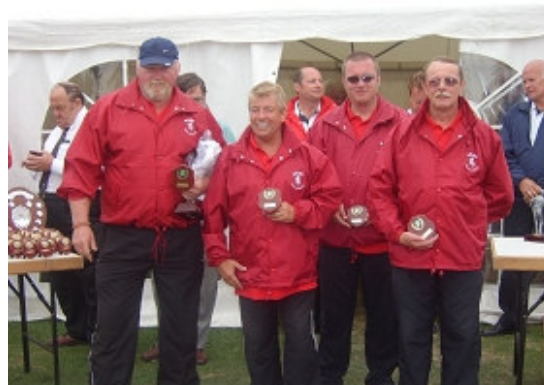
Pictured above – Kent 1 top team in the Challenge competition receiving their awards.