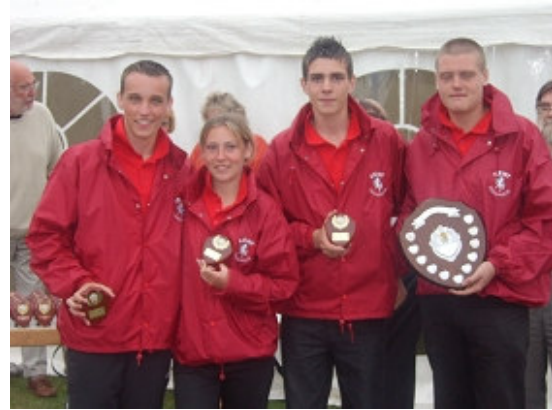
Pictured above Inter Regional Junior Champions 2005

For the second year running the result hinged on a penultimate round match against their closest rivals from Chiltern Region and once again their nerve held in a very tight match to secure the title.